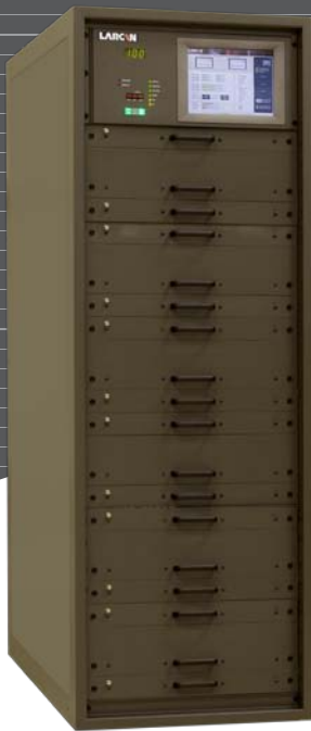
LARCAN Cool-Dock Series 6.6 kW DVB Transmitter