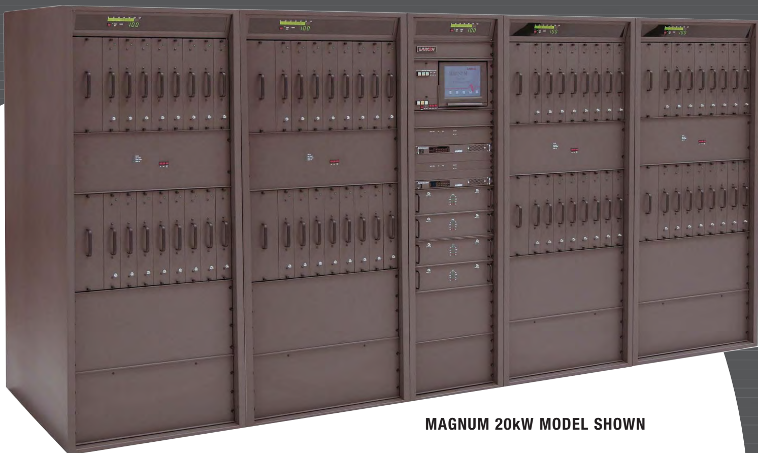
MAGNUM 20kW MODEL SHOWN

Digital Solid State UHF Transmitter 2.5kW to 20kW and beyond