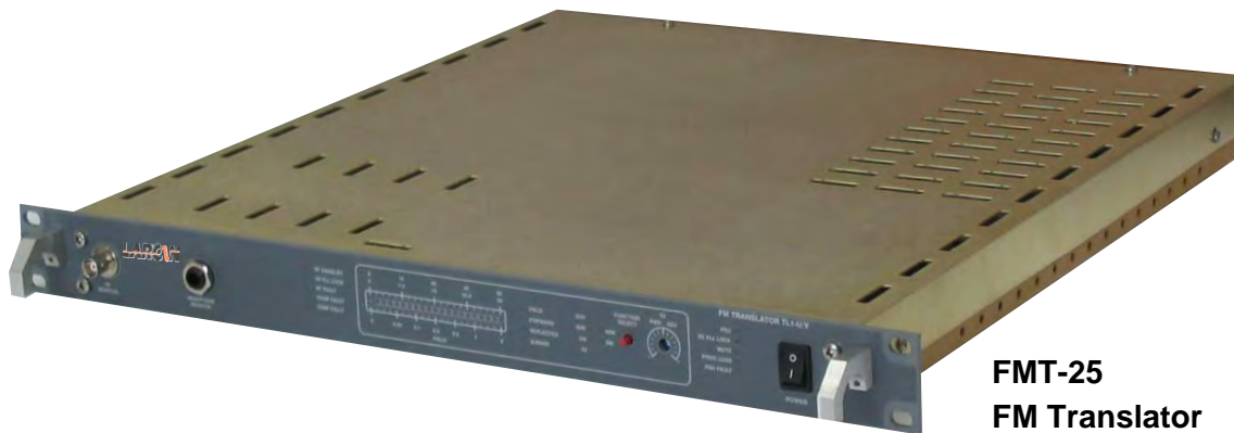
FMT-25 FM Translator