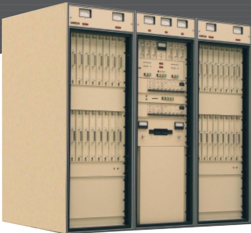
M SERIES 20KW MODEL SHOWN

Analogue Solid State VHF Transmitter 250watts to 80kW and beyond