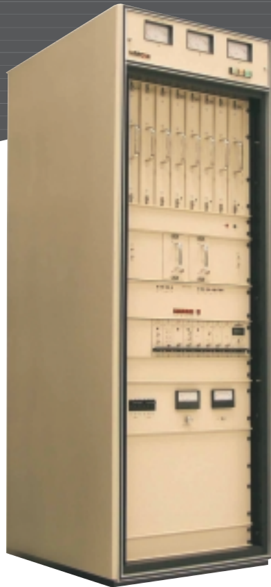
M SERIES 3kW

Analogue Solid State VHF Transmitter 250watts to 80kW and beyond