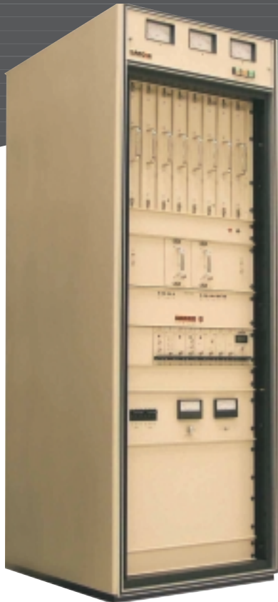
M SERIES 1kW

Analogue Solid State VHF Transmitter 250watts to 80kW and beyond