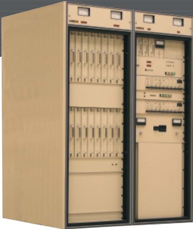
M SERIES 16kW

Analog Solid State VHF Transmitter 250watts to 80kW and beyond