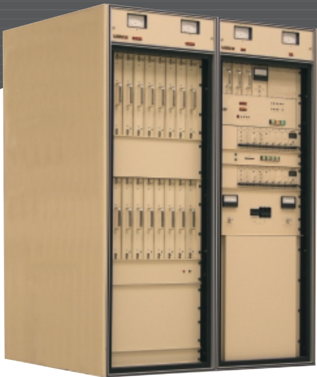
M SERIES 15kW

Analogue Solid State VHF Transmitter 250watts to 80kW and beyond